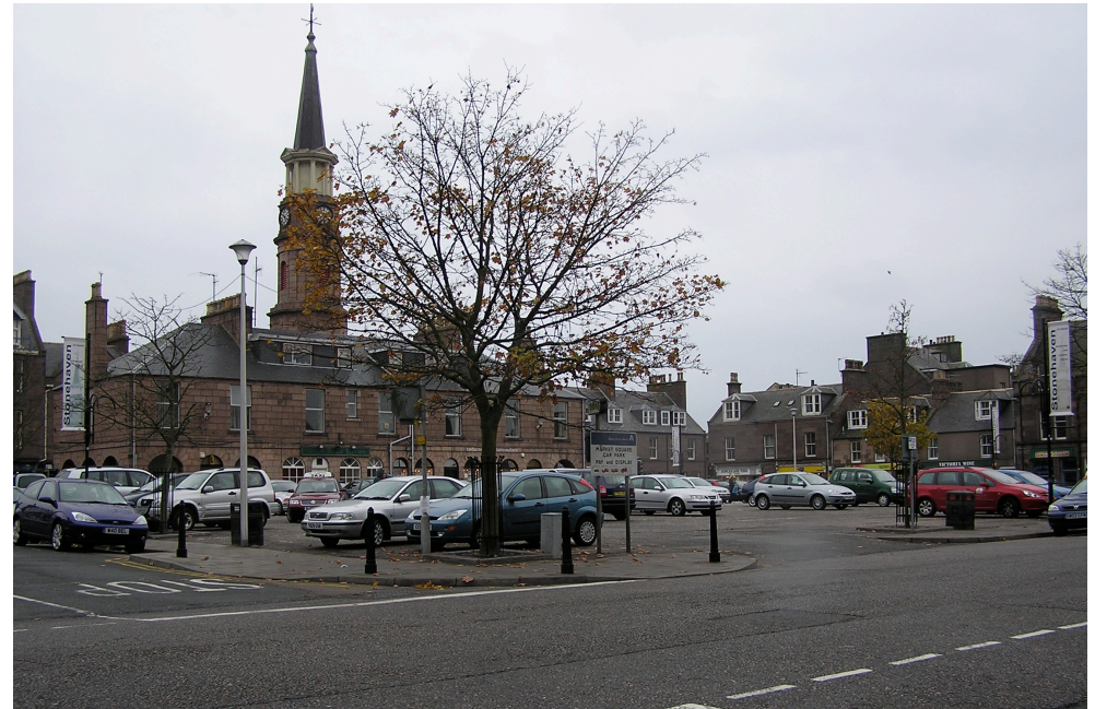
The Market Square in Stonehaven. This should be recorded as part of the Common Good of Stonehaven but Aberdeenshire Council deny the existence of any Common Good land in the town.